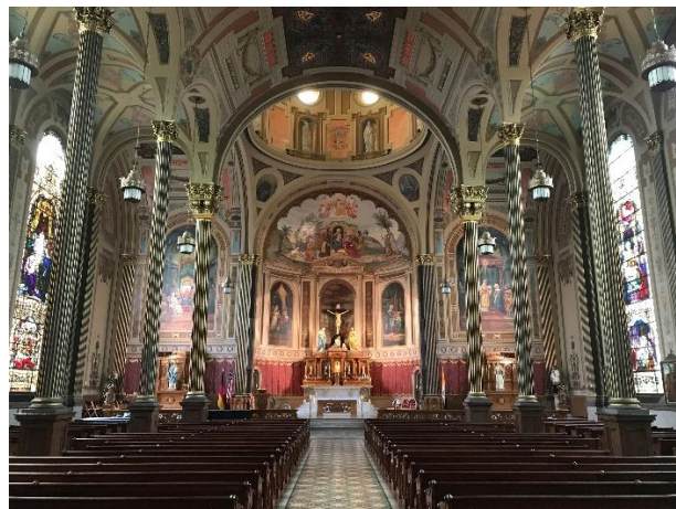
Mother of God