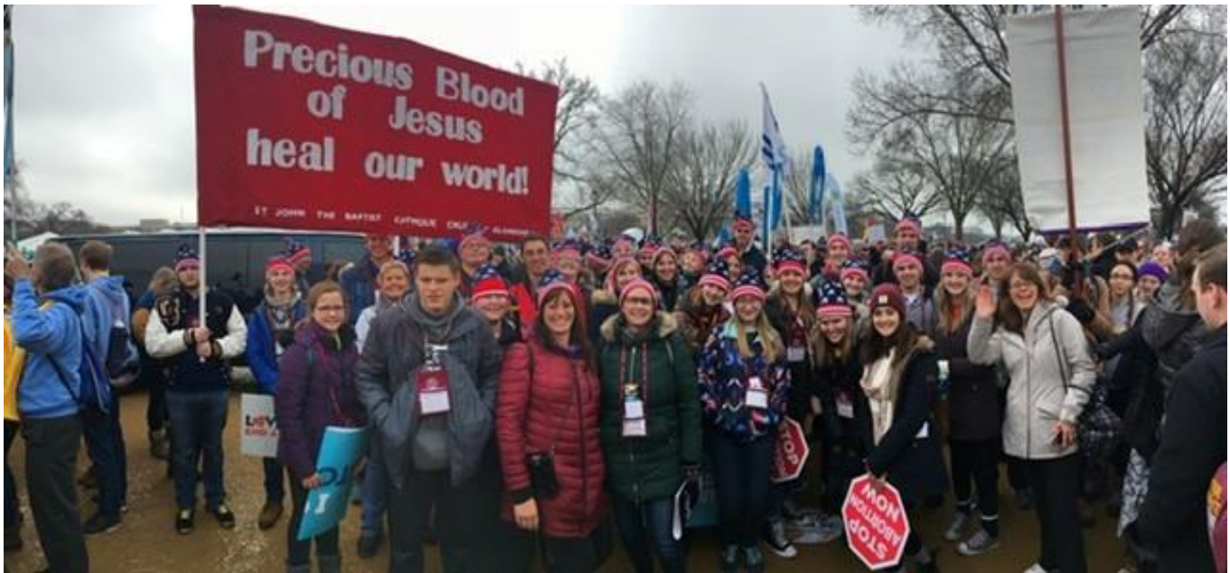
Our group that went to the Washington D.C. March for Life