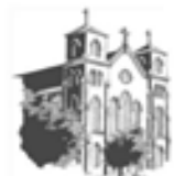
Emmanuel Church 1837

Served by the Missionaries of the Precious Blood