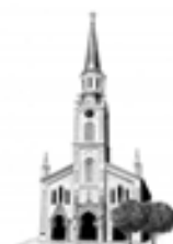
Holy Trinity Church 1861