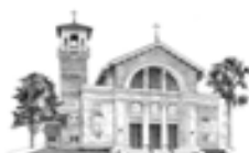
St. Joseph Church 1847