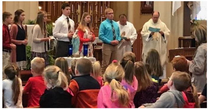
St. John's May Crowning Mass was held this past week