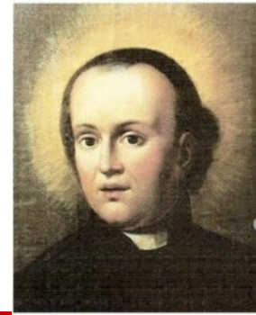
ST. GASPAR DEL BUFALO APOSTLE OF THE PRECIOUS BLOOD FEAST DAY, OCTOBER 21, 2022 PRAY FOR US!

2:00PM Confirmation with Monsignor Kubacki