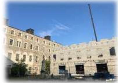
New Addition Construction