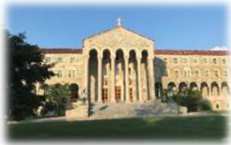
The Athenaeum of Ohio - Mount St. Mary's of the West Seminary