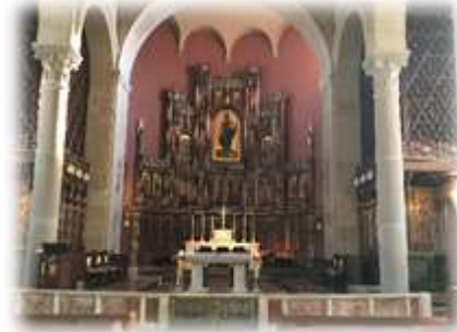
Chapel – St. Pope Gregory the Great