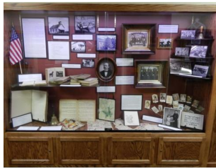
Country Schools & Village School