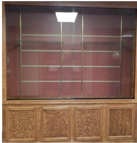
Lobby Display Case