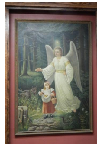
Guardian Angel Painting

All Glandorf High School trophies (pre-1965) are now in the front Gym lobby with the Glandorf High School graduating class pictures and the CYO trophies. All Elementary/Jr. High trophies (1965 thru present) were returned to the Elementary School.