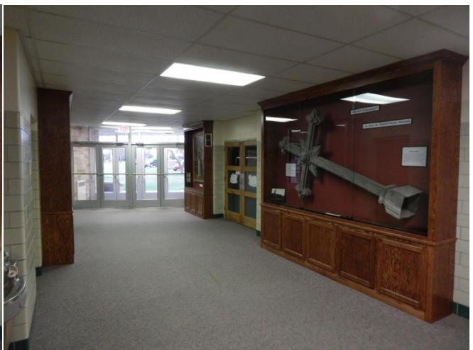
Parish Center Lobby