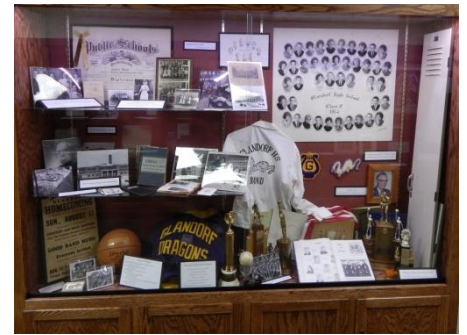
Glandorf High School