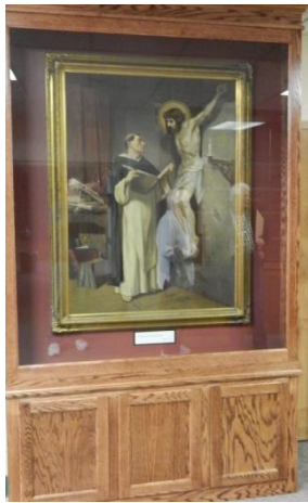
St. Dominic Painting